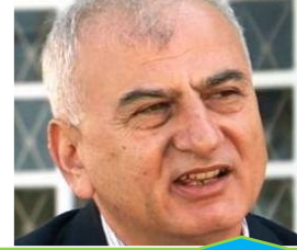
Former CEO, Aga Khan Rural Support Programme