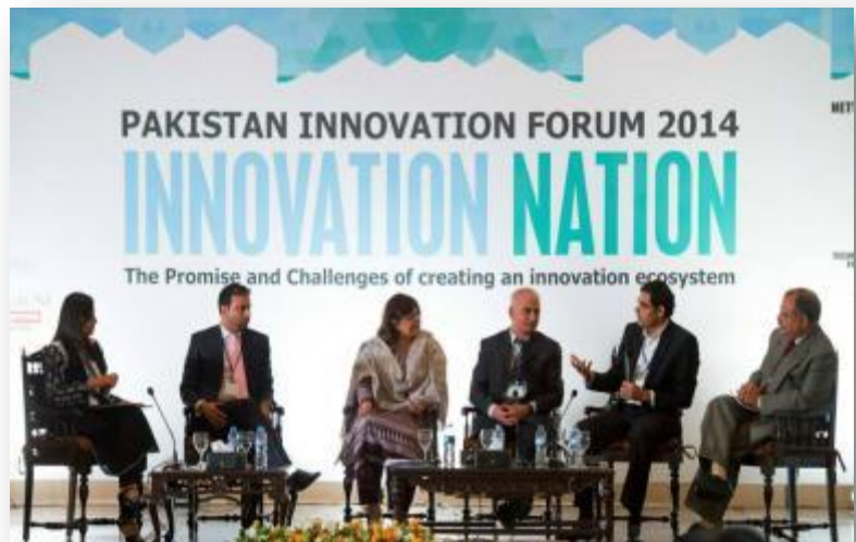
Panelists for the development innovation panel discuss creation of a sustainable social impact