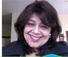
Senior Group Head, PPAF