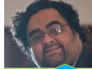
TV Host/Political Columnist Fasi Zaka