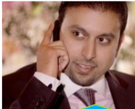
Managing Director, Enclude, Pakistan