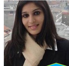
Comm. Specialist, USAID and Founder, DSF