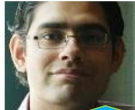
CEO, White Rice Communications