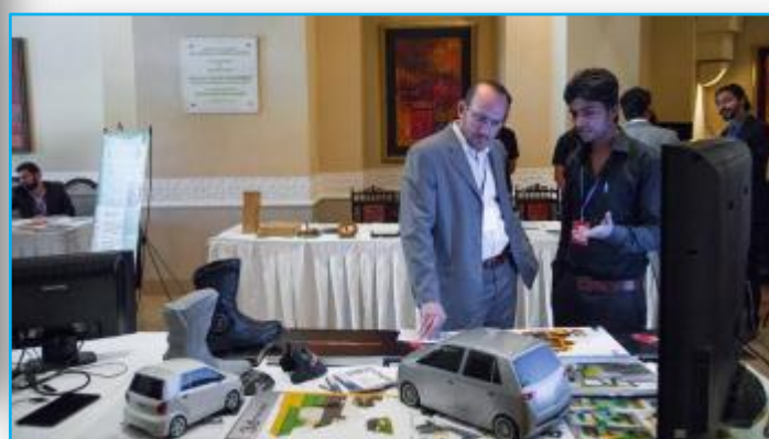
An exciting display by School of Art, Design & Architecture (University of Gujrat) was an attraction

A number of innovations by those who had worked with the Foundation such as a semi-automatic handloom ( khaddi ), an indigenous automotive smartphone-enabled anti-theft device, a 3D printer, automatic smartphone based irrigation control system, and several innovative e-learning solutions including ones by Knowledge Platform and MS-ITE (NUST), as well as the design portfolio of SADA at the University of Gujrat were on display.